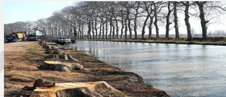
Canal Du Midi, France