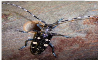
Asian Long Horned Beetle

A canker stain of plane, present in France where it is devastating plane stocks and landmarks.